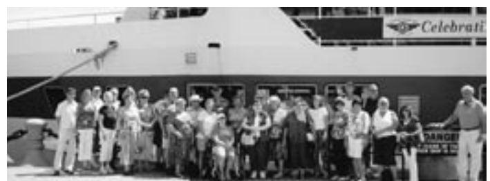
Region 3 members pose against backdrop of Goodtime III in August.