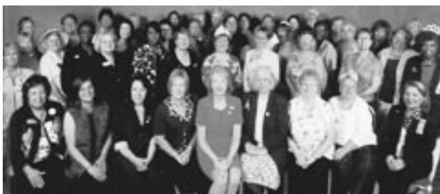
Pictured right are the 2008 State Presidents with National President Diane Polangin.

• You can do fitness on a budget. Did you know that a large can of broth is 3 pounds? Too light for you? Then use a 5 pound bag of potatoes. Then you can graduate to a gallon jug filled with water that weighs 8 pounds.