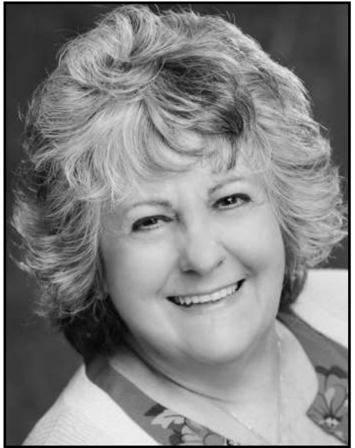
BPW/Ohio State President