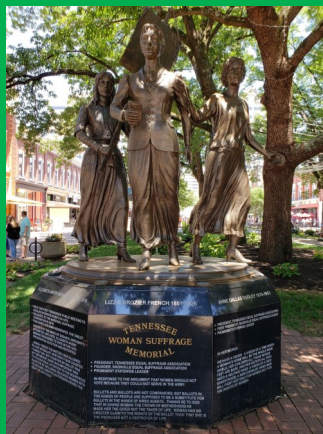
Suffrage History Knoxville TN