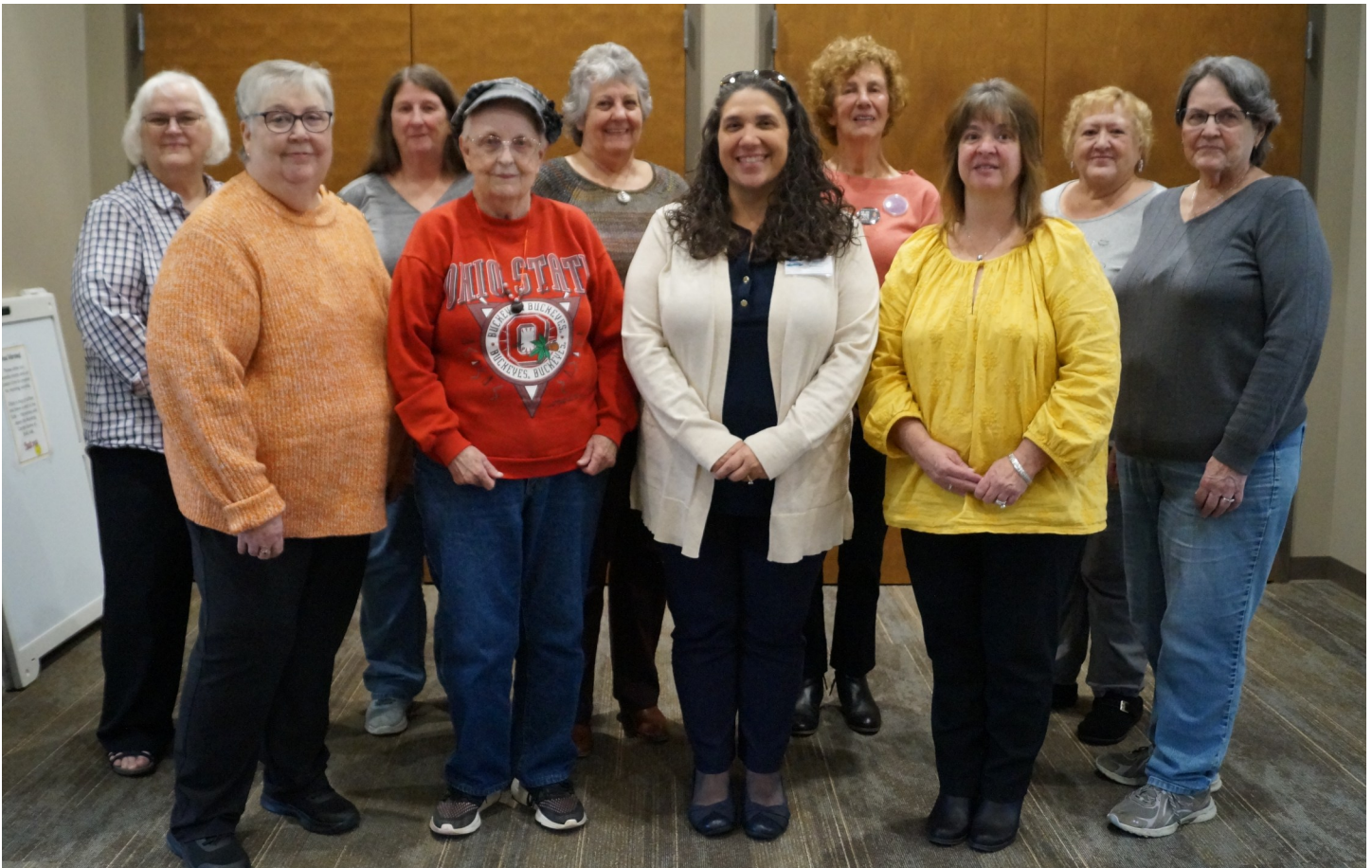
Region 4 meeting held on October 26, 2024 in Logan.