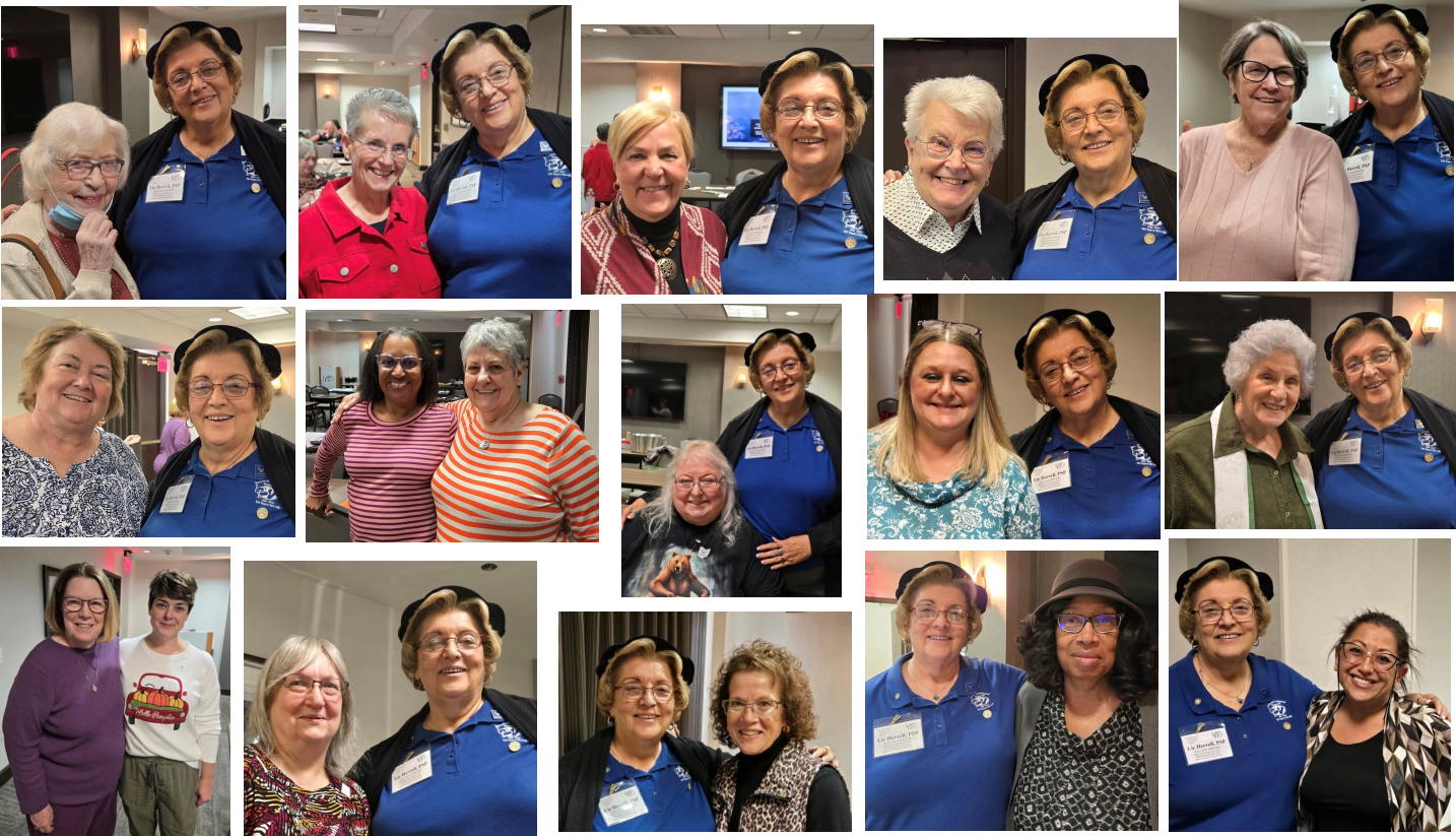
at the November 2025 BPW/OH State Board Meeting