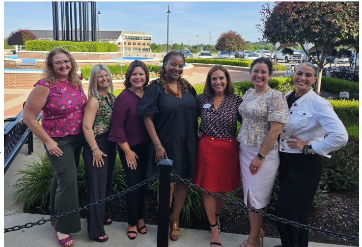
Pictured from left to right: