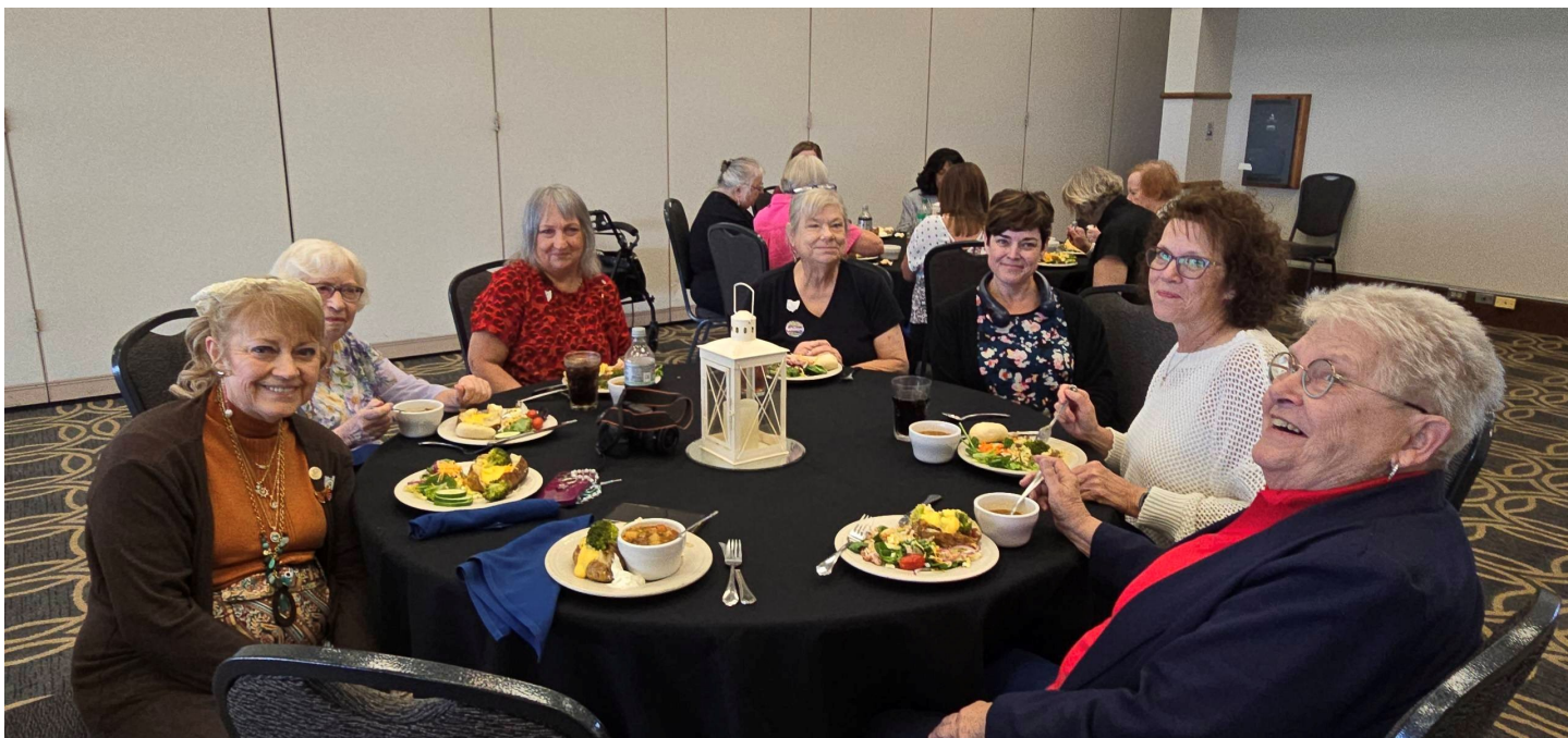
Members enjoying lunch at the BPW/Ohio State Board Meeting on August 23, 2025.