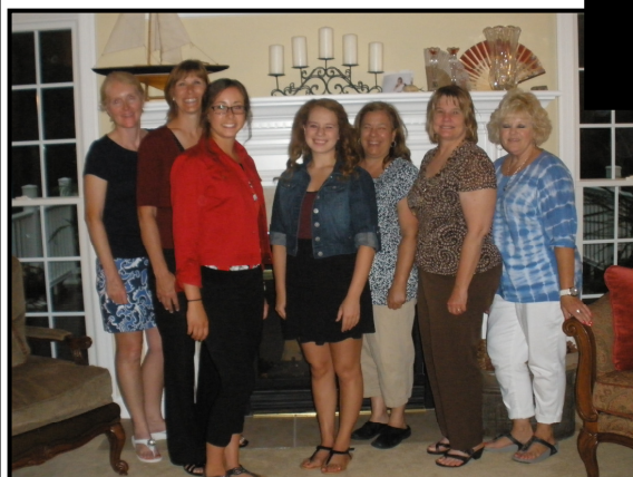
Lebanon BPW Region 5